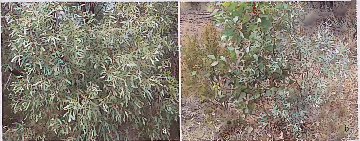
Figure 7: Eucalyptus polybractea subsp. polybractea , Inglewood. a. adult foliage; b. seedling, Inglewood.